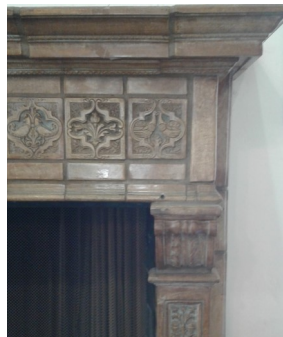
Fireplace, Whittier College