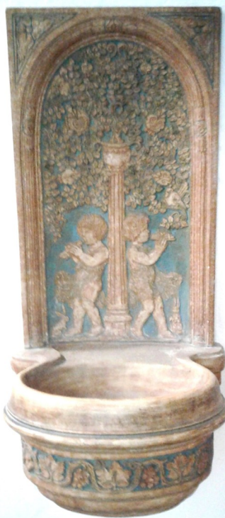
Above and Below: Two fountains at the Red Cross, one is painted over.

As tastes changed to a more streamlined, modern or contemporary look, Batchelder tile fell out of popularity, and homeowners began removing it, hiding it behind wood or dry-wall panels, or in many cases painting over it.